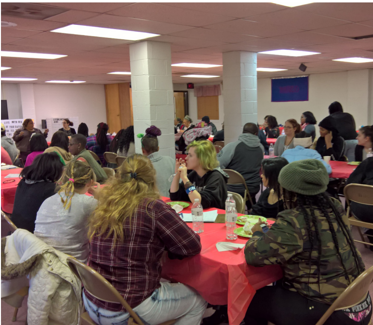
A record crowd listens to answers from a Q&A panel at the 2017 National Women & Girls HIV/AIDS Awareness Dinner.

The McKeesport Collaborative and the HIV/AIDS Working Group would like to thank Bethlehem Baptist Church and everyone who presented at the 2017 National Women & Girls HIV/AIDS Awareness Dinner. Both groups appreciate the many people who attended. The event made a significant impact on HIV awareness for women and girls living in the Mon Valley.