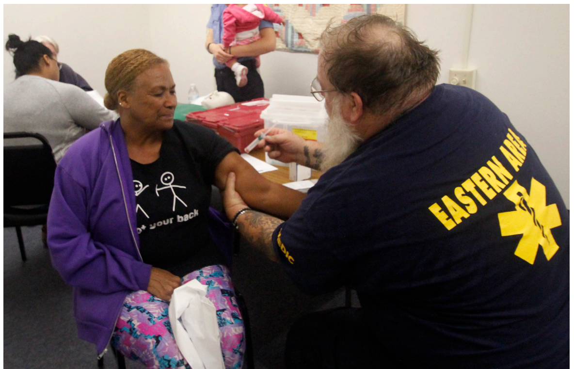
Community Resource Fair attendee receives free flu shot from Eastern Area PreHospital Services staff

HSCC's 6th Annual Community Resource Fair was held on October 20th. Everyone in attendance received a ticket for free ice cream. The event also raffled off many prizes such as various gift