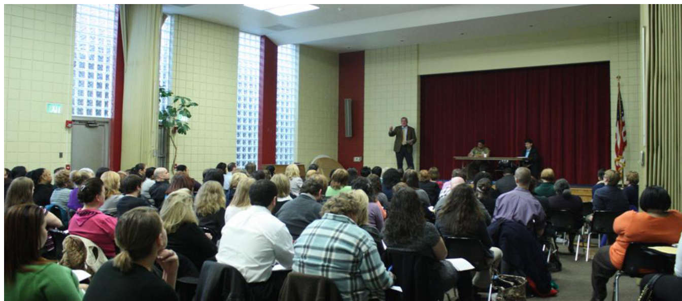
Over 150 participants attended, listening to the three speakers share their insight.

The Working Group on Health plans to hold future seminars on this topic. If you are interested in more information, please call the Mon Valley Providers Council at 412-829-7112.