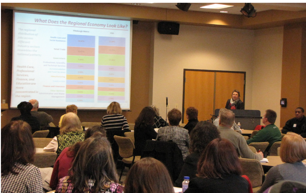
Students listen to the introductory lecture at How to Get a Job and Keep It.